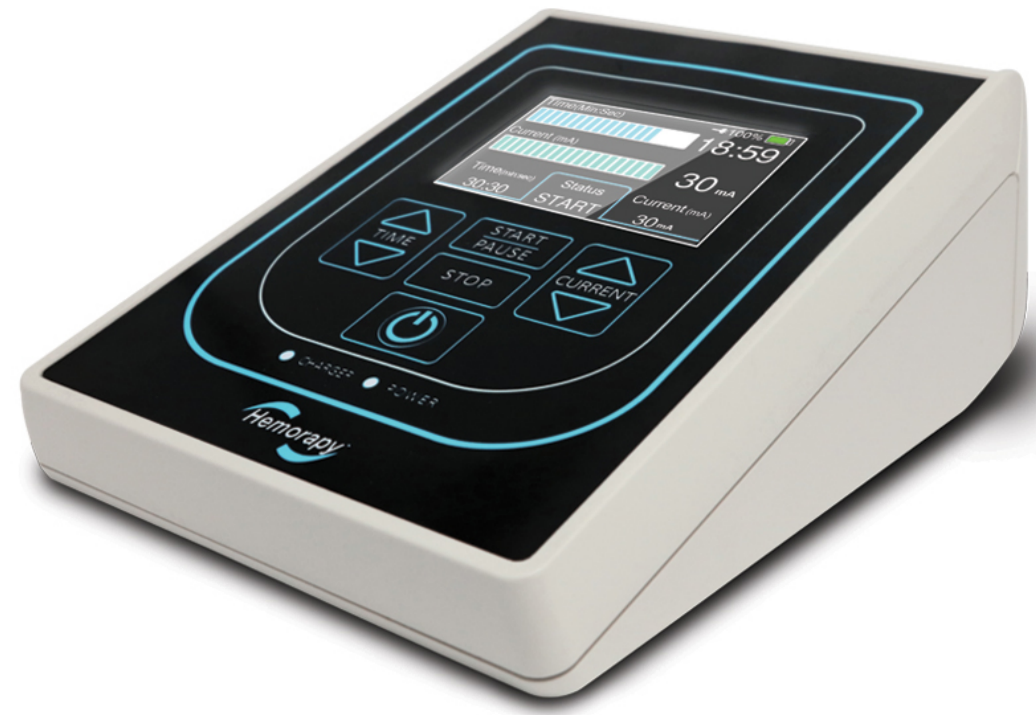
MODEL: IEH 16 Physician's office Usage