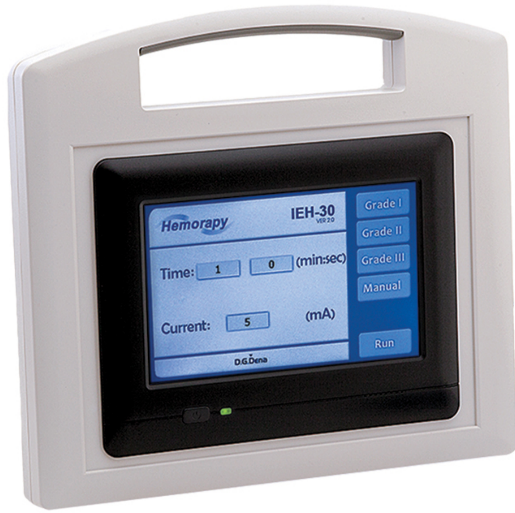
MODEL: IEH 30 Hospital Usage